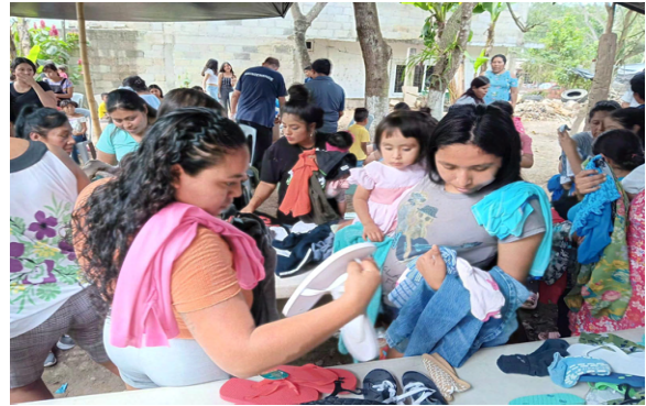
Women getting clothes for their family after the GCOM outreach in Tihuatlan, Veracruz