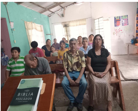
A church in Poza Rica with church members sitting on their new church benches built by ministry supporters in rural Minnesota. Mexican church members varnished the benches.

Recently, a group of four of us went on a ministry trip to Poza Rica, in central Mexico, to facilitate training leaders, do evangelistic outreaches, distribute Gospel literature and Bibles and to bring benches to various needy churches in and near Poza Rica. These benches had been built by a group of men of different area churches near my hometown of Madison, Minnesota.